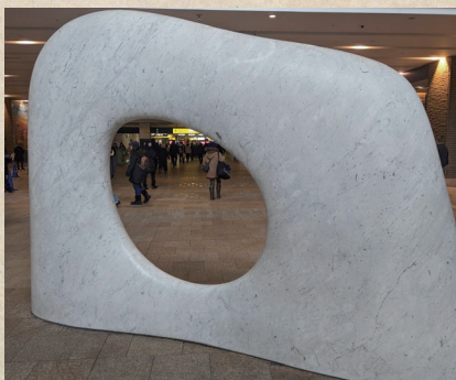
Kan Yasuda "Myoumu"