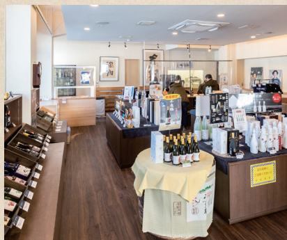
Chitosetsuru Sake Museum